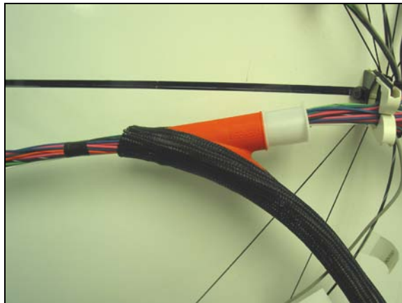
The “spreader” of the tool is then inserted into the PowerBraid. With the tool inserted, pull the tool down the length of the PowerBraid. This will insert the harness into the braid as it is pulled.